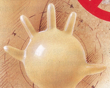
Each glove is 100% visually and inflation tested for structural integrity