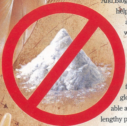
Glove powder-related, postoperative problems are eliminated

For more information about the powder-free Biogel® Surgeons' Glove, call 1(800)763-6364.