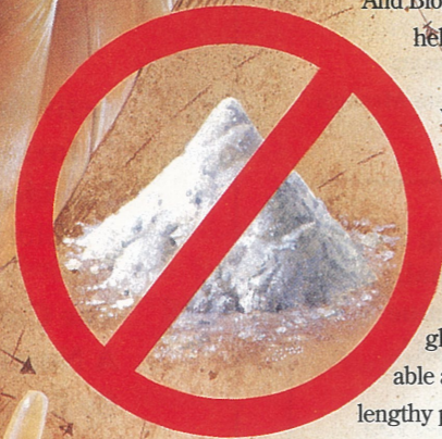
Glove powder-related, postoperative problems are eliminated

That means unsurpassed barrier protection, glove after glove. And Biogel® gloves are hypoallergenic to help prevent the chapping, chafing and discomfort often associated with surgeon's gloves.