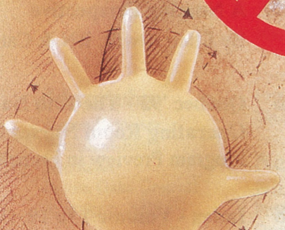
Each glove is 100% visually and inflation tested for structural integrity

For more information about the powder-free Biogel® Surgeons' Glove, call 1(800)763-6364.