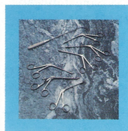
Downs Surgical is a part of AESCULAP LTD

Parkway Close, Parkway Industrial Estate, Sheffield, South Yorkshire S9 4WJ England. Tel: +44 742 730346 Telex: 547667 DOWSURG Fax: +44 742 701840