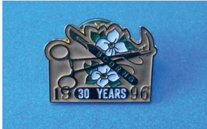
BCORNG 30-year pin presented to founding and past executive members.

Without the dedication of so many perioperative nurses, who have advocated for perioperative patients and perioperative nursing practice throughout the province and across Canada, our history would be negligible.