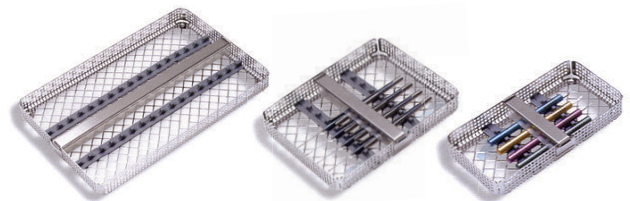
E45.111 1/1 Size - Format 275 x 178 x 24mm